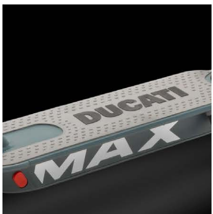
Up to 40km of range, 360Wh battery