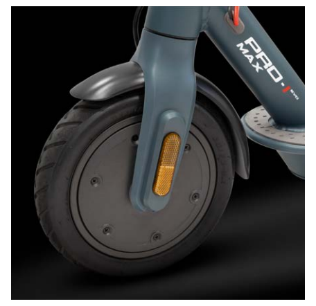
350W motor, Peak Power: 500W